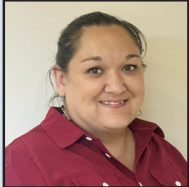
Brittany MSR New Accounts & Lending - Old Town