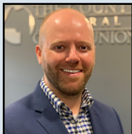
Dustin Retail Services Manager - North