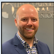
Dustin Retail Services Manager - North