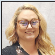
Amber Full-time Teller Presque Isle