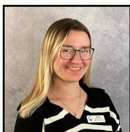
Corin Member Service Ctr Rep. - Caribou