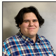
Alden Consumer Loan Operations Processor I Caribou