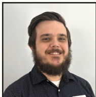
Austin Full-time Float Teller North