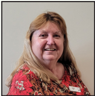
Virginia Full-time Float Teller North