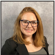
Elexus Full-time Teller Caribou